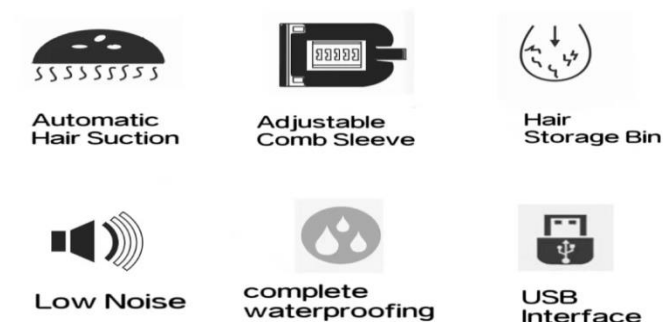
Figure 1. System Function Settings