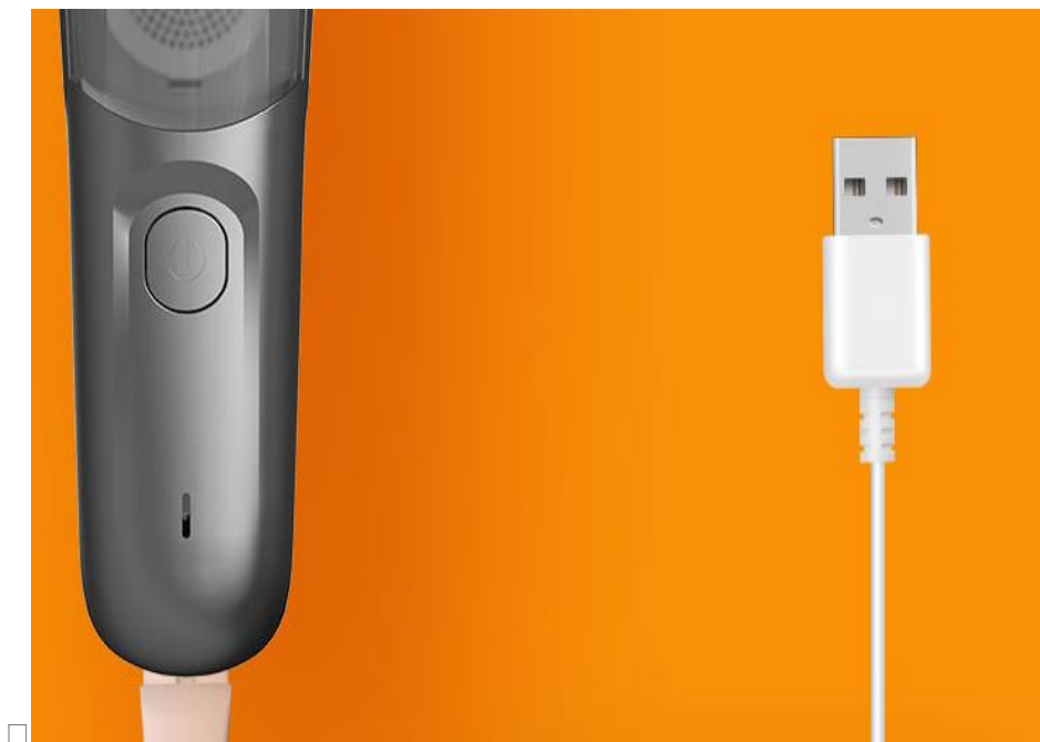
Figure 7. USB interface

The USB interface can also be used to connect various accessories, such as different types of cutting heads, trimmers, or other accessories, making the hair clipper more flexible and adaptable to different hair cutting needs.