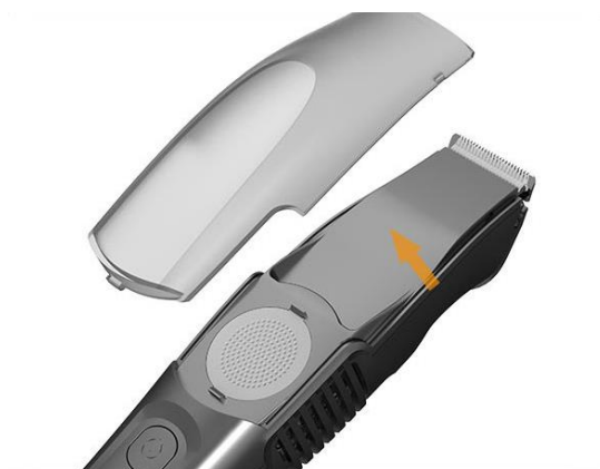
Figure 4. Hair storage bin

Set up a hair storage bin, as shown in Figure 4, to prevent hair from scattering in the surrounding environment. At the same time, users can easily empty the container, handle inhaled hair, and maintain equipment hygiene.