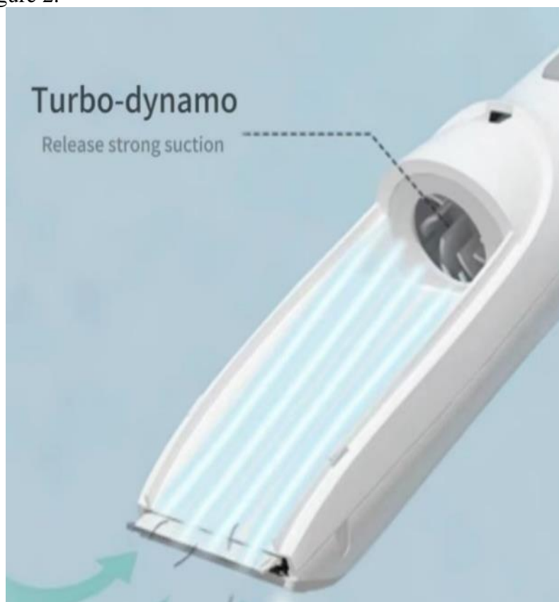
Figure 2. Hairdressing turbine motor

Equipped with a turbo motor and vacuum system, hair can be directly sucked into the inside of the hair clipper, avoiding hair scattering in the hair cutting area. Simultaneously equipped with a filtration system to ensure that sucked hair does not cause damage to the motor and other internal components, extending the lifespan of the hair clipper. The structure of the hair clipper turbine motor is shown in Figure 2.