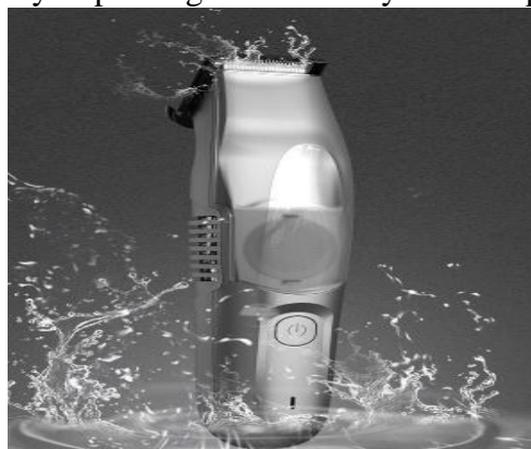
Figure 6. Waterproofing of the entire machine