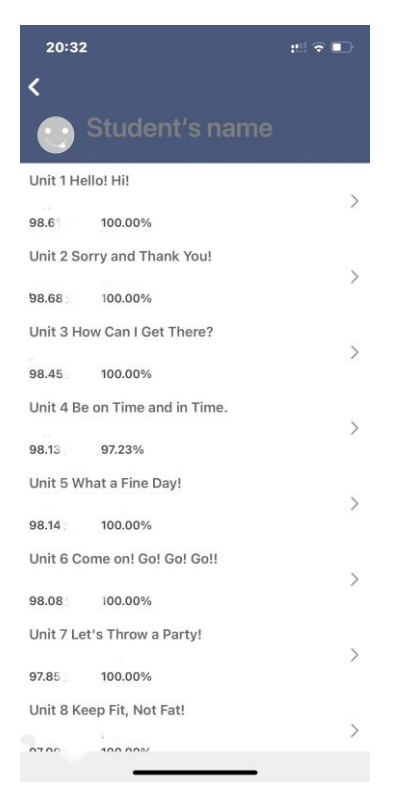
Figure 2. Student's learning scores