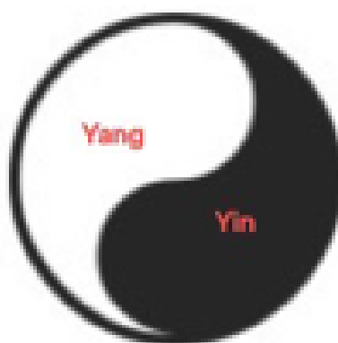
Figure 1. Changes of Yin and Yang properties in each stage of the endometrium

stems from the periodic changes of the endometrium, and the periodic changes of the endometrium change in Yin and Yang in different stages. Professor Xia proposed that the change of menstrual cycle is related to the rhythm of the biological clock of Tai Chi. With Yin and Yang, the fluctuation and transformation are opposite, and the rhythm of Yin and Yang is in the form of round movement, thus causing the change of menstrual cycle [3-4]. The "Changes of Yin and Yang properties in each stage of the endometrium" and "Conversion of Yin and Yang of Traditional Chinese medicine Tai Chi" as shown in Figure 1 and Table 1 below: