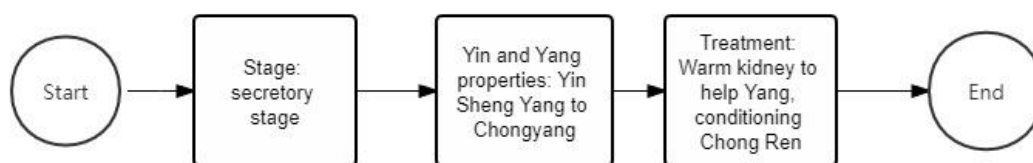
Figure 3. Secretion period