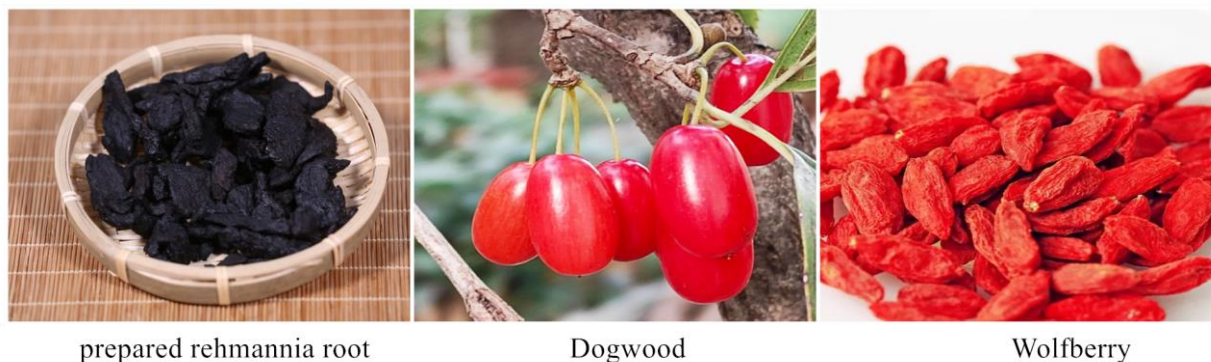
Figure 5. Selected medicinal herbs

the "Materia Medica" once recorded: "Enter the foot Shaoyin, the foot Jueyin meridian". It is a product that nourishes the liver and kidney, which is peaceful properties. Fangzhong drugs are treated from the liver and kidney, aiming to restore the function of "opening and closing the pivot" in the three yin, and the drugs in Zuogui Wan assist each other, which is a classic prescription for the treatment of intellectual disability liver and kidney insufficiency, as shown in Figure 5.