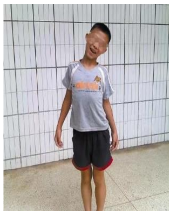
Figure 3. Children with ID

Intellectual disability (ID), also known as intellectual retardation or mental retardation, refers to mental development disorders manifested by deficit disorders in intelligence and adaptability, mostly occurring between 0 and 18 years old [6-7]. Due to the high incidence of the disease, about 1% ~ 3%, and the personal impact on the physical and mental health of the majority of children, and even the happiness index of family and society, in recent years, the world medicine for intellectual disability related research is increasing and deepening, especially in the treatment of traditional Chinese medicine [8]. This disease is equivalent to the five delay-language delay disease of traditional Chinese medicine, and the clinical characteristics are slow response, slow speech, sluggish expression, distracted mindlearning difficulties, social adaptability defects and self-care ability defects, as shown in Figure 3.