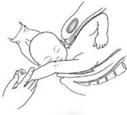
Figure 4. Birth trauma

Kidney is the innate foundation, spleen is the acquired foundation, kidney acquired essence comes from the nourishment of the essence of the five organs, if the birth of malnutrition, weaknessfall damage to the brain, or difficult labor and abdomen at the time of delivery, will lead to acquired deficiency, the kidney hidden acquired essence is insufficient, and then cause delayed speech, as shown in Figure 4.