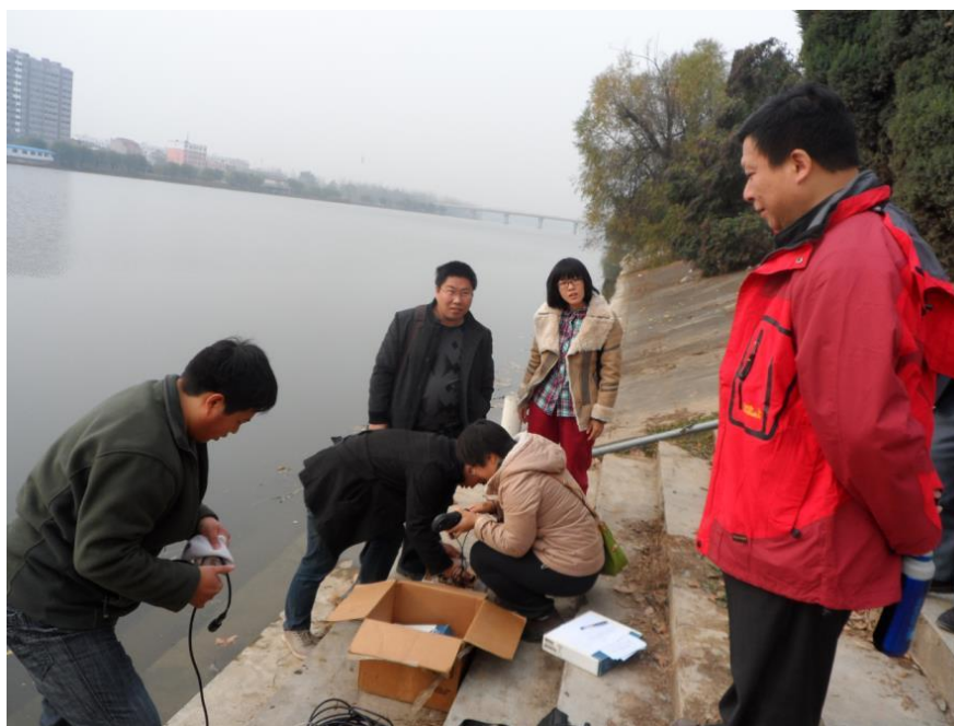
Figure 2. Practice of Water Resources Planning

(8) Comprehensive training of water resource planning: Through comprehensive training projects, students can apply their knowledge and skills to practical projects, carry out comprehensive water resource planning work, including project research, data analysis, scheme design, etc., and cultivate students' comprehensive quality and practical abilities [10].