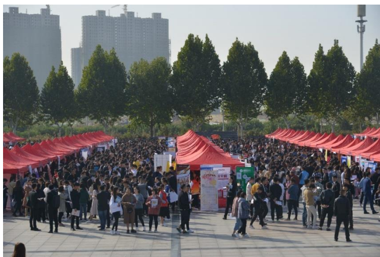
Figure 1. Employment site of university students

In recent years, the total number of college graduates in China has also gradually expanded. Many college students are unemployed when they graduate. Under such a huge employment pressure and situation, many college students are prone to anxiety and fear, and fear that they will not find a job after graduation. One of the main factors that cause colleges and universities to fall into this dilemma is that many colleges and universities lack efficient and sound teaching reform mechanisms and processes. In the process of actual teaching reform, colleges and universities have not better combined social employment pressure, market development trend and talent employment standards to implement "mass entrepreneurship and innovation" education reform and innovation, resulting in many college students do not have the awareness and ability of innovation and entrepreneurship(Figure 1). Therefore, students are likely to be in a disadvantaged position in the fierce talent competition, which ultimately leads to the low employment rate of colleges and universities [7].