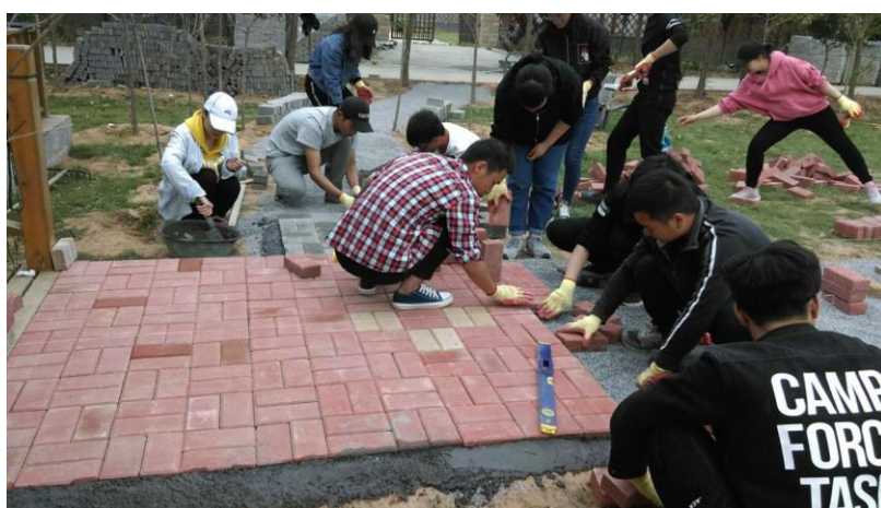
Figure 3. Practical teaching of landscape architecture innovation