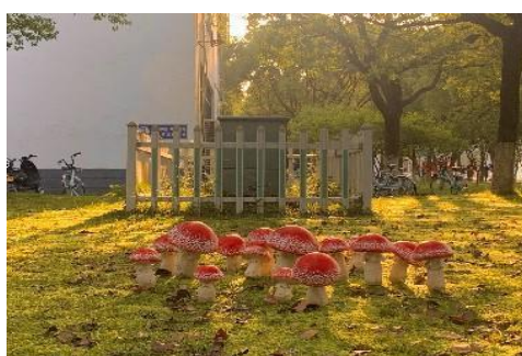
Figure 6. Mushroom community