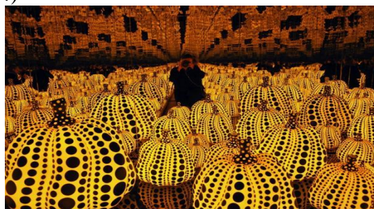
Figure 3. Yayoi Kusama's Wave-Point Pumpkin

The installation works of art after the rain expressed by the design concept: in the footsteps of a hurry, if you meet as if it did not belong to this small piece of space, try to drop ideas, go close to it quietly feel. In the post-epidemic era, we will firmly believe that the epidemic will eventually pass. College students in the new era should have a mushroom-like spirit. The more violent the storm, the more vigorous the vitality[10]. Dozens of mushrooms with red umbrellas and white rods are used as the shapes of the device. The microporous materials are mainly selected and hand-made. The device works in the use of color configuration, the bold use of high-purity color creation. The combination of bright red and white produces a vivid visual effect, very eye-catching. His work was inspired by the Japanese artist Yayoi Kusama's 1 Podoo pumpkin (Figure 3) and French artist Paul Gramkin's 2 1,600 paper pandas. (Figure 4)