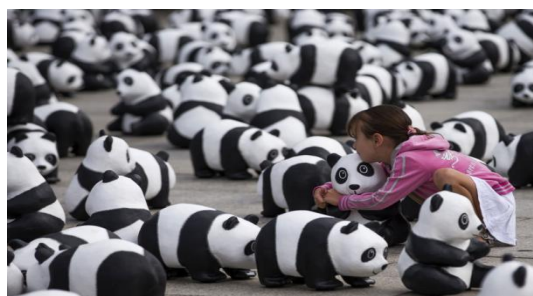
Figure 4. 1600 paper pandas

The main interactive elements of the work include a strong visual impact, interesting furnishings, and a small enclosed space of installations and environment to form an immersive installation art, which works place dozens of mushrooms in small spaces around the lawn, allowing the public to enter and interact with them. (Figure 5) This constitutes an immersive device that combines with its surroundings to create a special interactive art form. The combination of these interacting factors can close the distance between the public and art, and enable the public to observe, contact, think more deeply, communicating and interacting with art. This unique, interesting way of communication, not only people can be happy in the soul, but also people can experience the fun of art together.