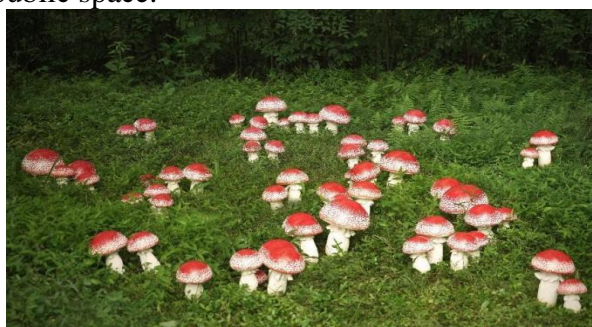
Figure 5. Mushroom community

The distribution of mushroom community had been adjusted three times during the demonstration stage. (Figure 6) Based on the analysis of the questionnaire, the sites with more people were selected. During the public display process, the work attracted many teachers and students to stop. There are three types of behavior: discussing and thinking about the authenticity and details of the work, getting in touch with it through the senses, taking pictures with friends and promoting it online. The main goal of this creation is to add interest to the campus environment, enhance students' life happiness, enliven the campus artistic atmosphere, and achieve harmony between man and nature. This work will be on public tour in the school. From a practical point of view, promote the integration of campus culture and popular culture and the development of installation art in campus public space.