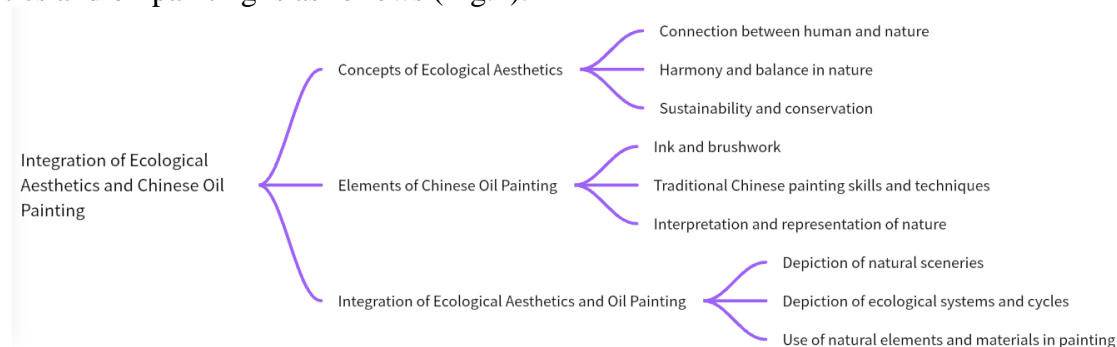
Figure 2. The mind map for the integration of eco-beauty concepts and oil painting

Adopting natural ecological aesthetic education, first of all, we should study the natural ecological beauty involving multiple disciplines, through which we can help students better understand and appreciate the ecological beauty of natural landscapes. If a river or lake is polluted, destroying the original ecological beauty itself, we are willing to work for the restoration of the complex ecosystem, so that the river or lake can be filled with the beauty of vibrant life. After learning the knowledge in the textbook, it is more important to guide students to experience the natural beauty and feel the ecological beauty of nature [9] . The conceptual integration of ecological aesthetics and oil painting is as follows (Fig.2).