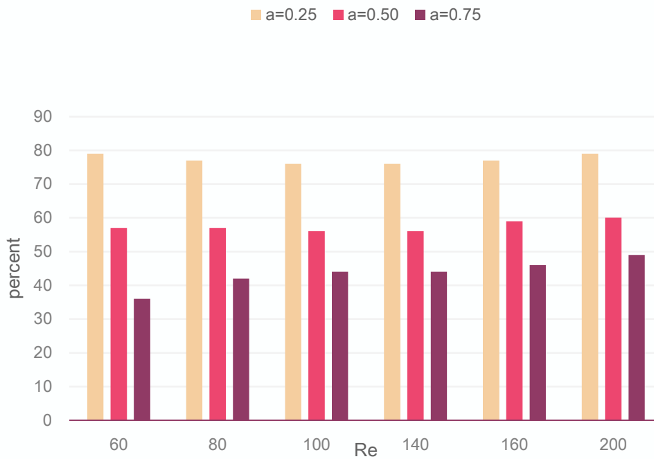
Figure 3. Changes in lift control efficiency at different Reynolds and a values

From Figure 3 : when a=0.25, the lift force can be reduced to 75%-80% according to the method proposed in this paper; when a=0.5, the lift force can be reduced to 60% level; when a=0.75 , the lift amplitude can be suppressed below 50%. This fully shows that the lift flow control scheme proposed in this paper can effectively reduce the lift on the cylinder, which is of great significance for solving the vortex-induced oscillation in engineering and the resulting fatigue damage.