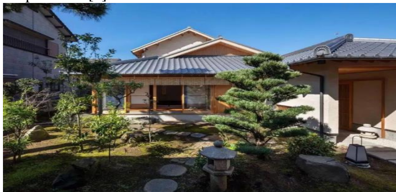
Figure 5. Japanese courtyard design

Mengchuang Guoshi's works are characterized by the huge pond, the edge of the pond and a winding style called dry landscape. From the perspective of landscape, Japanese gardens can be used for monotonous landscapes, pools, mountain buildings, palaces, teahouses, terraces, etc. Japanese court buildings are characterized by simplicity, delicacy, elegance and beauty in all seasons. They are not different from Chinese court buildings in four seasons. The Japanese court usually symbolizes nature with simple and rich works. The design of details reflects the super light control of space and environment on natural elements, as shown in Figure 5. The connotation of Japanese courtyard culture is based on the Zen culture, and later on, it has been integrated with the calm and indifferent temperament [4].