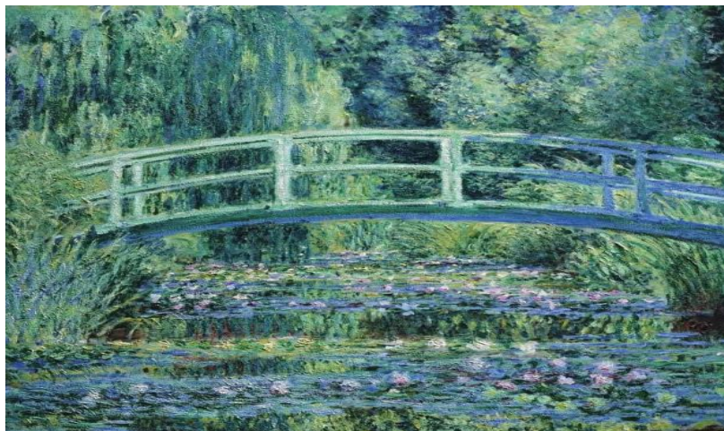
Figure 6. Monet's "Japan bridge"

Zen temple in Kyoto in the Muromachi era, and was designed to imitate the nature. It is also called "Zen courtyard" and "dry" landscape. In contrast, these representative Zen courtyards at that time had different forms, but the essential styles around them were always changing. Ponds, rocks, gravels and mosses create different levels of landscape. The distant shrubs give a rolling hill shape. The rugged rocks and small rivers in the foreground make green everywhere. In the courtyard of Kanagawa Prefecture, Japan, orderly stepping stones are arranged in a row of inclined sand, and larger boulders are surrounded by bright green ground covers. In the Zhiyin Temple in Kyoto, the exposed tree roots are integrated into the Zen garden to achieve the natural characteristics. The smaller ornamental trees replace the stone and boulder to decorate the dry landscape, as shown in Figure 7. Through careful combination of rocks, water features, mosses, pruned trees and shrubs. Create a miniature stylized landscape and use raked gravel and sand to represent rippling water surfaces.