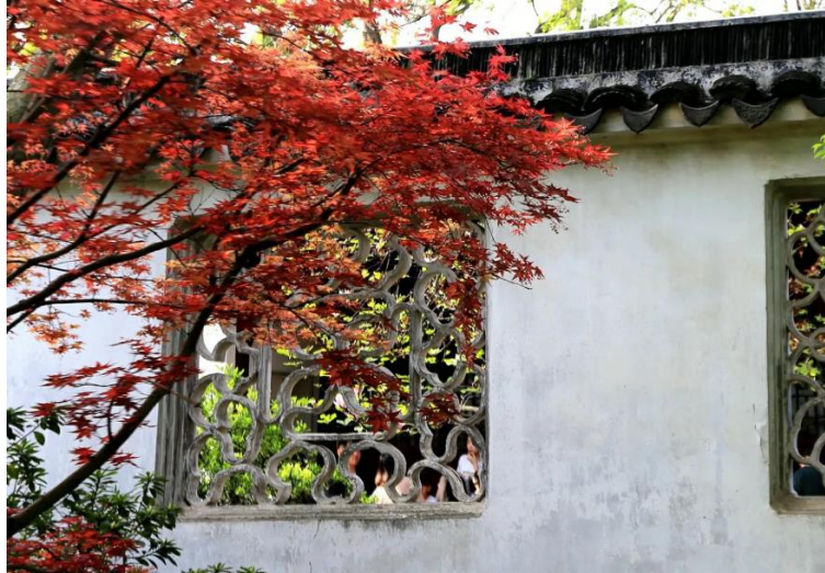
Figure 2. Design of lattice window

common main element of Chinese courtyard architecture. When the white walls are covered with thick ivy leaves, the static environment of the courtyard is full of natural vitality. In addition to the vines on the wall, the tables and chairs beside the pool can bring simple elegance to the courtyard. In order to create a quiet and elegant atmosphere in the courtyard as much as possible, the road surface is often designed as fancy, as shown in Figure 3. In addition, the conscious use of color changes in the site design can enrich and improve the monotonous atmosphere of the courtyard.