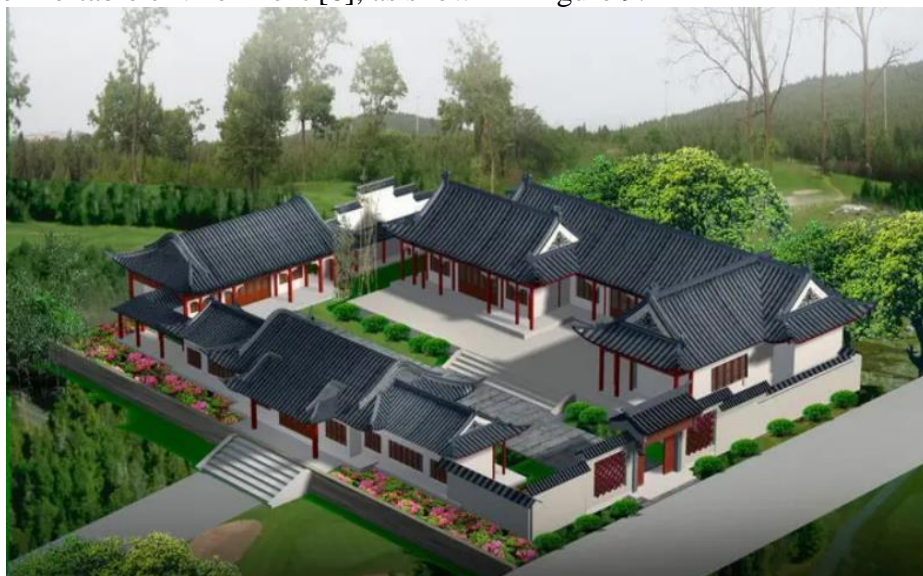
Figure 8. Courtyard design in northern China