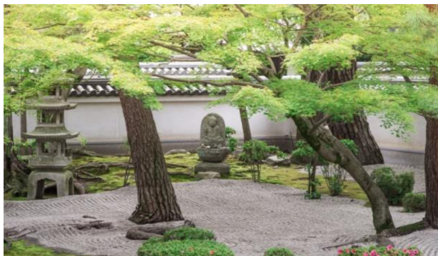
Figure 7. Courtyard of Zhiyin temple in Kyoto