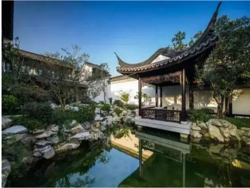
Figure 1. Chinese courtyard design