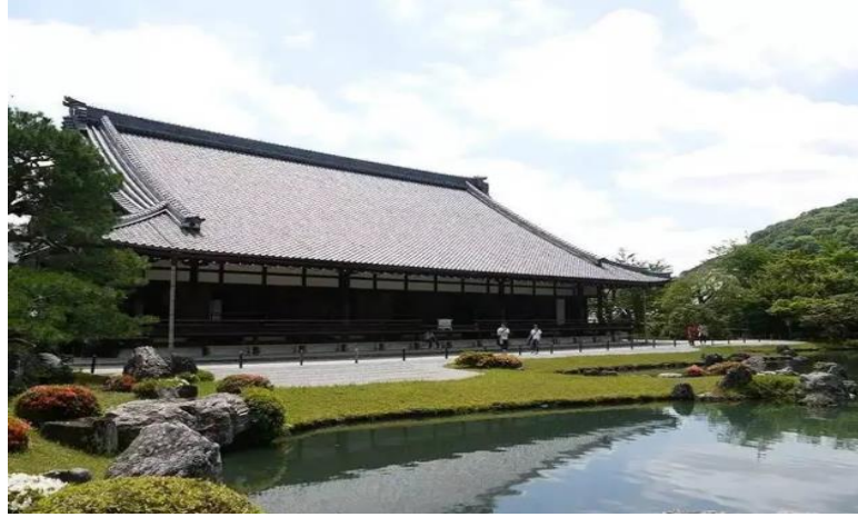
Figure 4. Courtyard of Tianlong temple

more and more simple and abstract. The courtyard of Xixi Temple and Tianlong Temple designed by the most famous craftsman Mengchuang Guoshi in the Kamakura era, as shown in Figure 4, is the representative of this style, which played a key role in the later Japanese courtyard design.