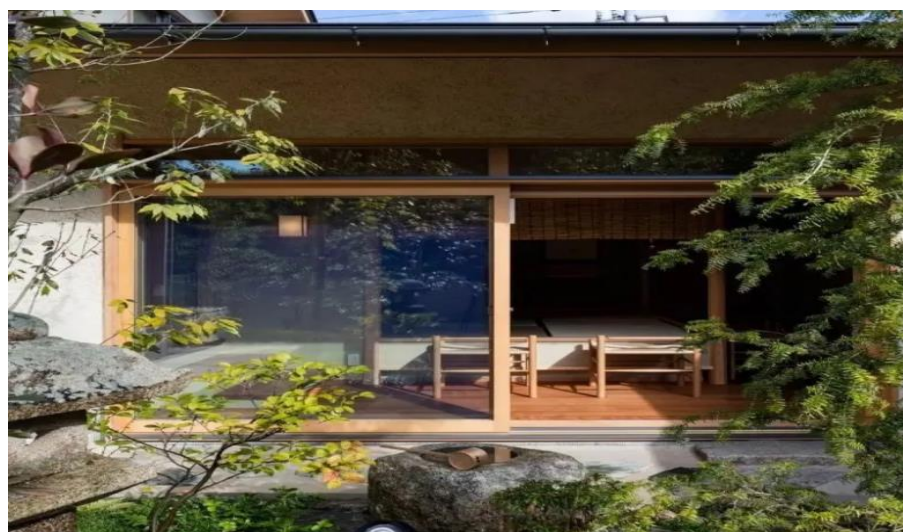
Figure 9. Design of Japanese style courtyard porch