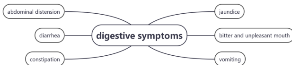
Figure 2. A series of digestive symptoms