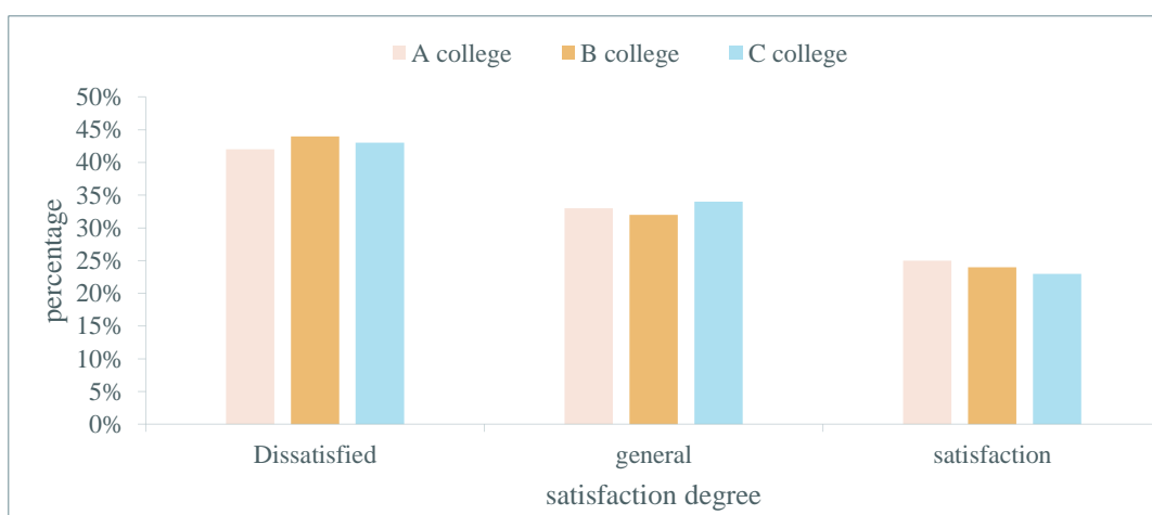
Figure 1. Satisfaction with the current training model