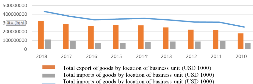
Figure 3. Change of total import and export volume of business units in Zhejiang Province in recent ten years

It can be seen from the analysis that although the total import and export volume of goods fluctuated in the past few years, the total import and export volume continued to expand and became more closely connected with the world market. In the two weeks of March 2020, the US stock circuit breaker will be four times, which in the long run indicates that a global recession is coming. Therefore, China's response is crucial, and it is prudent to use monetary and fiscal policies to deal with the possible global financial crisis again. In addition, the economy of the it is mainly composed of the economies of Jiangsu, Zhejiang and Shanghai. At present, it is only a simple sum of the economic strength of the three regions, and the overall scale benefit of "1+1>2" has not been realized.