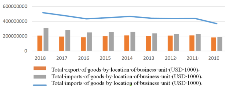
Figure 1. Change of the total import and export volume of the places where the business units are located in Shanghai in recent ten years