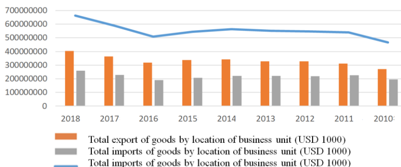
Figure 2. Change of the total import and export volume of the places where the business units are located in Jiangsu Province in recent ten years