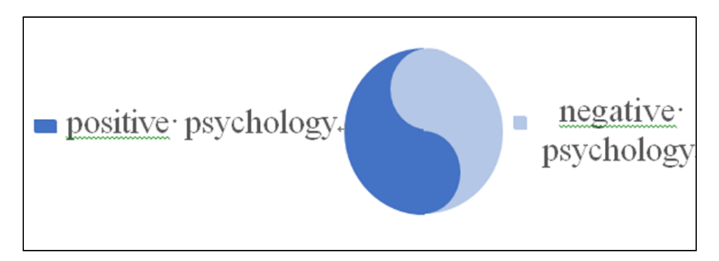
Figure 3. The Balanced Psychological System